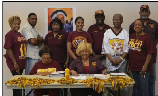
With St. Petersburg/Pinellas County Chapter Members

Some of my community involvement activities includes mentoring students in the Pinellas County schools, the schools system from which I retired in 2012, and serving as the Bethel Community Baptist Church clerk, chair of the church Sanctuary Building Project, and chair of the Pastor's Aid.